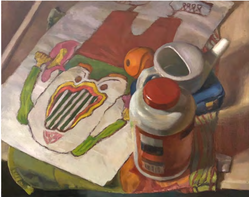
Still Life with Childhood Drawing (1970: Self-Portrait) oil on Dibond, 16 x 20 inches, $2,400.