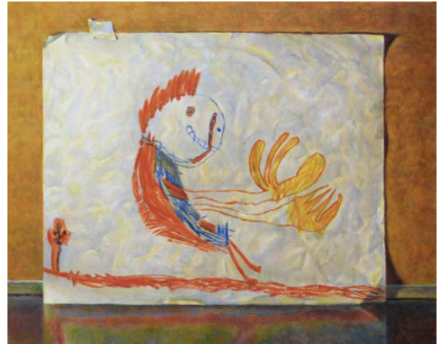
Still Life with Childhood Drawing (1970: Stumble) oil on linen, 16 x 20 inches, $3,000.