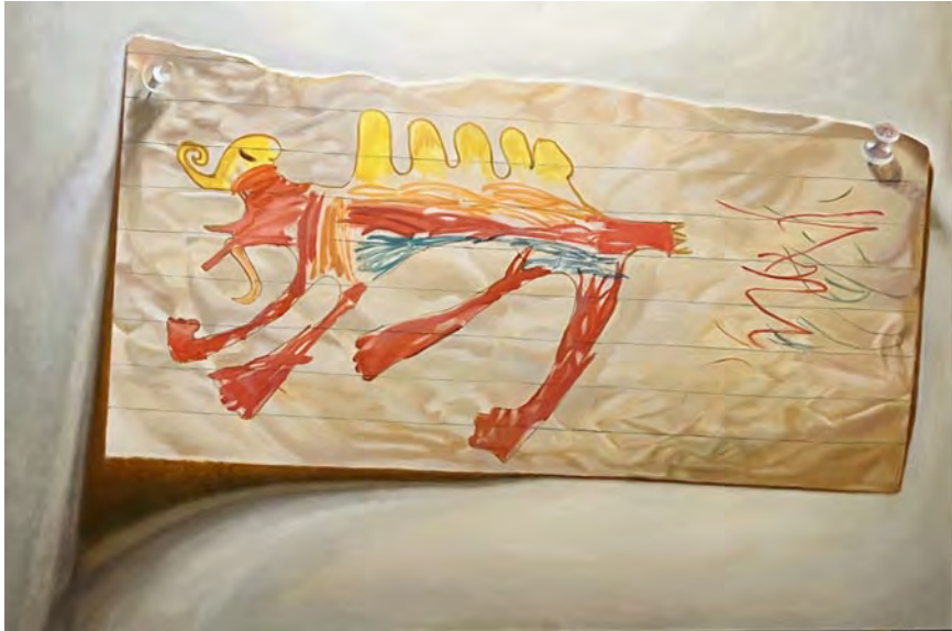
Still Life with Childhood Drawing (1971: Ambivalence) oil on linen, 32 x 48 inches, $9,000.