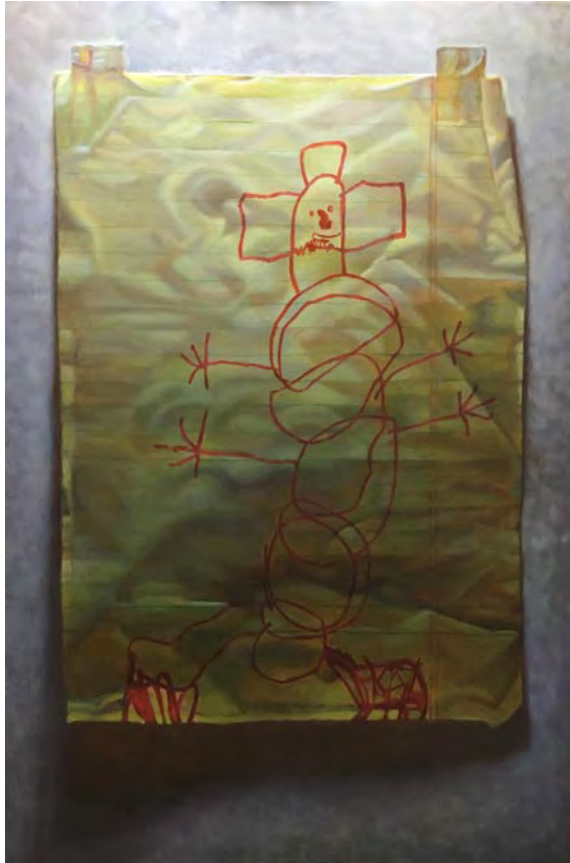
Still Life with Childhood Drawing (1970: Emerge) oil on linen, 48 x 32 inches, $9,000.