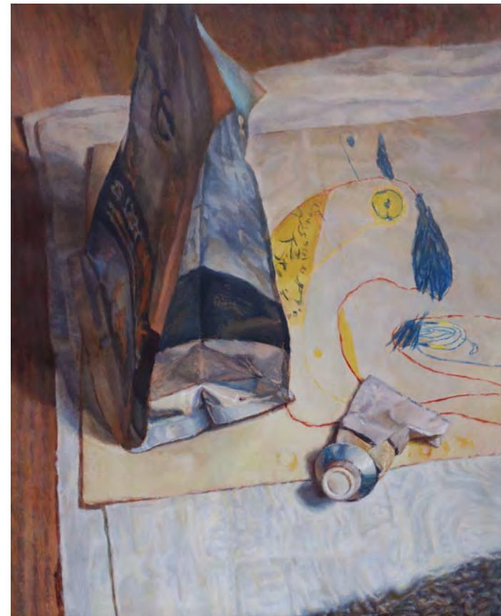
Still Life with Childhood Drawing (1970: Journey) oil on linen, 30 x 24 inches, $6,000.