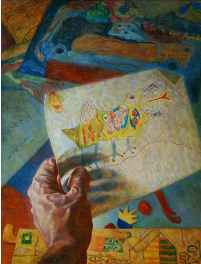
Still Life with Childhood Drawing (1970: Monster) oil on linen, 40 x 30 inches, $8,000.