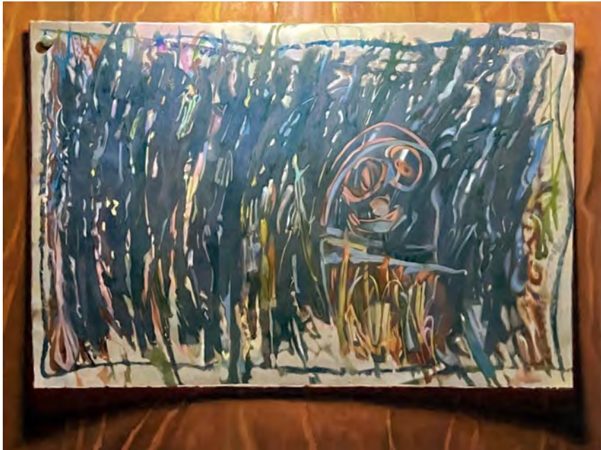
Still Life with Childhood Drawing (1971: Ghost III) oil on linen, 60 x 80 inches, $20,000.