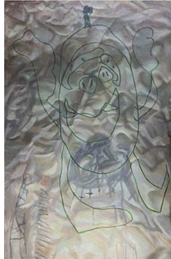
Still Life with Childhood Drawing (1970: Evasion) oil on linen, 50 x 32.37 inches, $9,000.