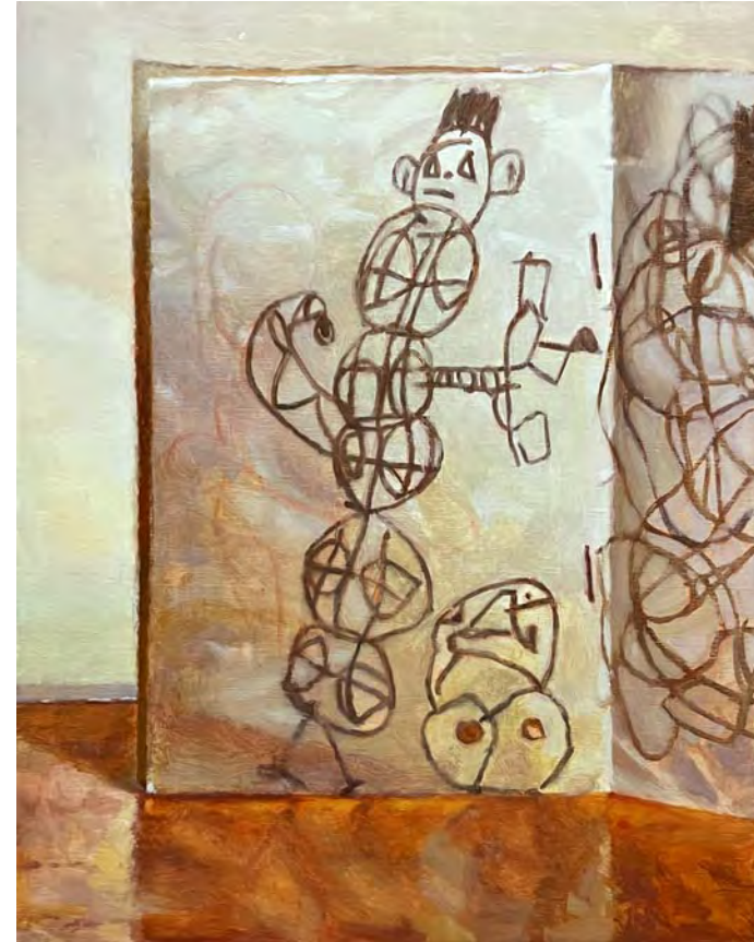
Still Life with Childhood Drawing (1971: Recoil) oil on linen, 16 x 20 inch, $3,000.