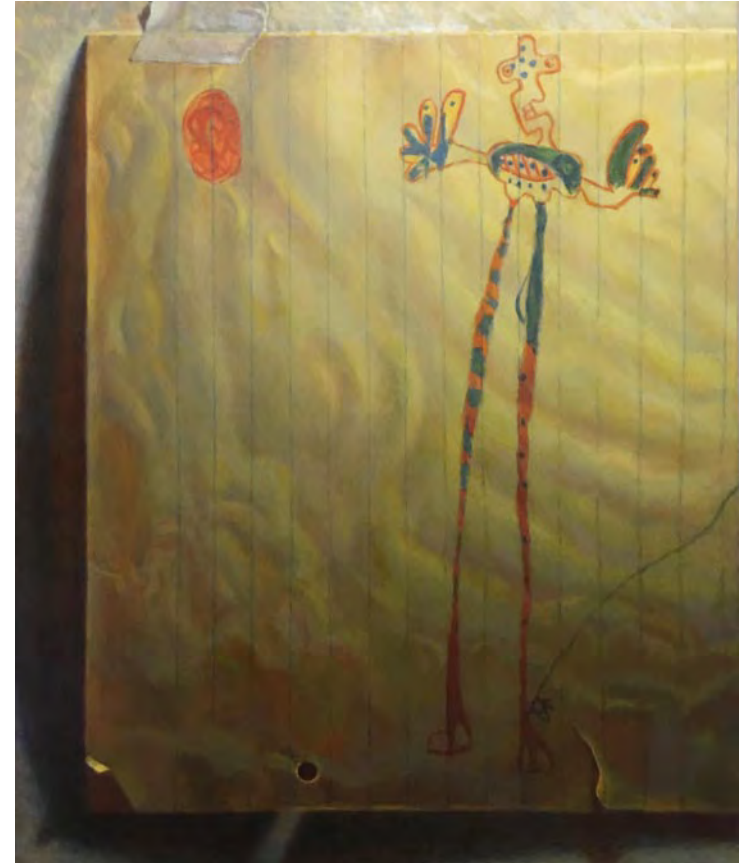
Still Life with Childhood Drawing (1970: Tilt) oil on linen, 36 x 30 inches, $7,500.