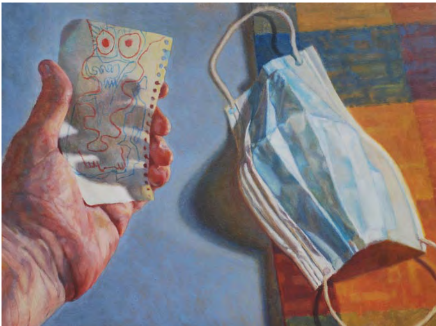
Still Life with Childhood Drawing (1971: Anxiety) oil on linen, 18 x 24 inches, $3,800.