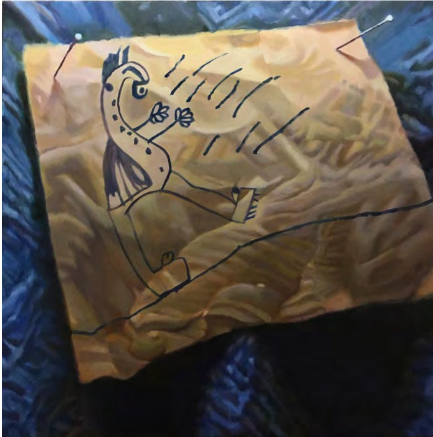
Still Life with Childhood Drawing (1970: Arrows) oil on linen, 32 x 32 inches, $7,000.