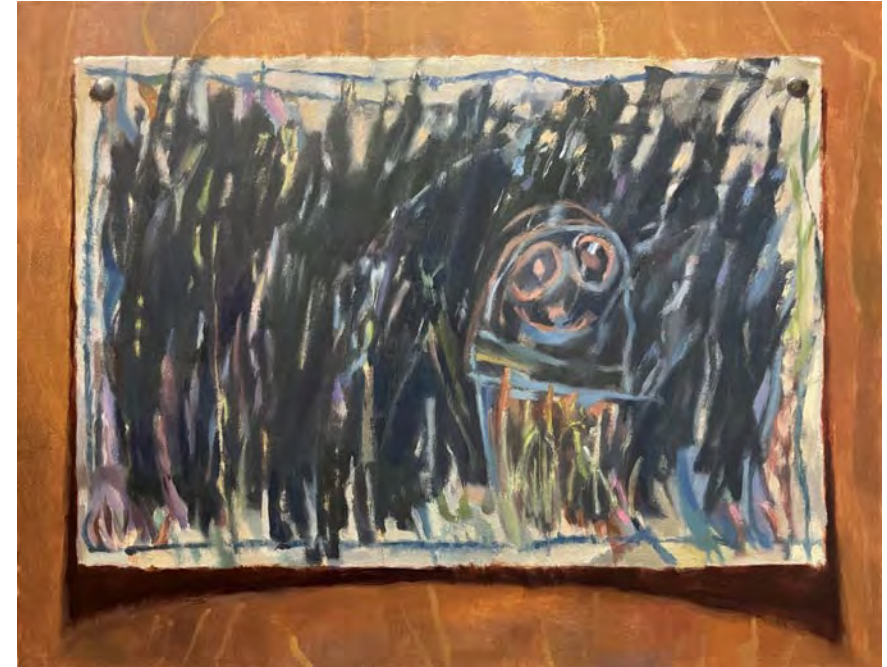
Still Life with Childhood Drawing (1971: Ghost II) oil on linen, 16 x 20 inches, $3,000.