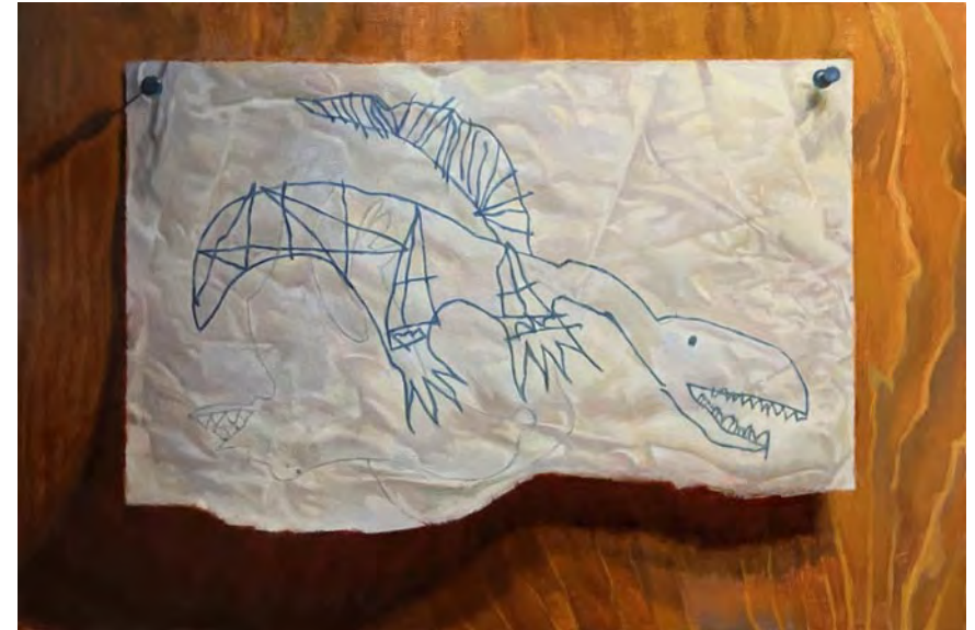
Still Life with Childhood Drawing (1971: Flight) oil on linen, 24 x 36 inches, $7,500.